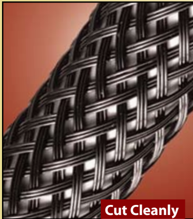
Cut Cleanly Hot Knife